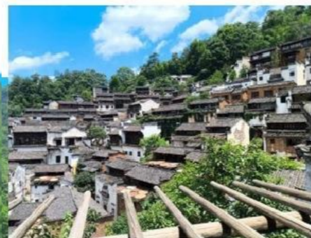
Historical and Cultural Excursion