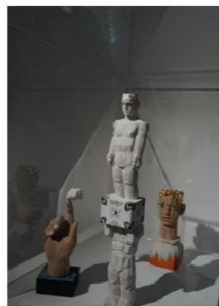
Taoxichuan Chinaware Town